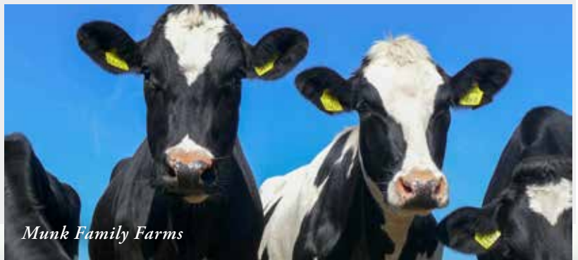
Munk Family Farms

Munk Family Farms - Visit this Dairy Farm in Northern Utah, operated by father-son duos. Discover the auto-arousal milking parlor which milks 40 Holstein heifers three times per day, averaging 11 gallons per cow.