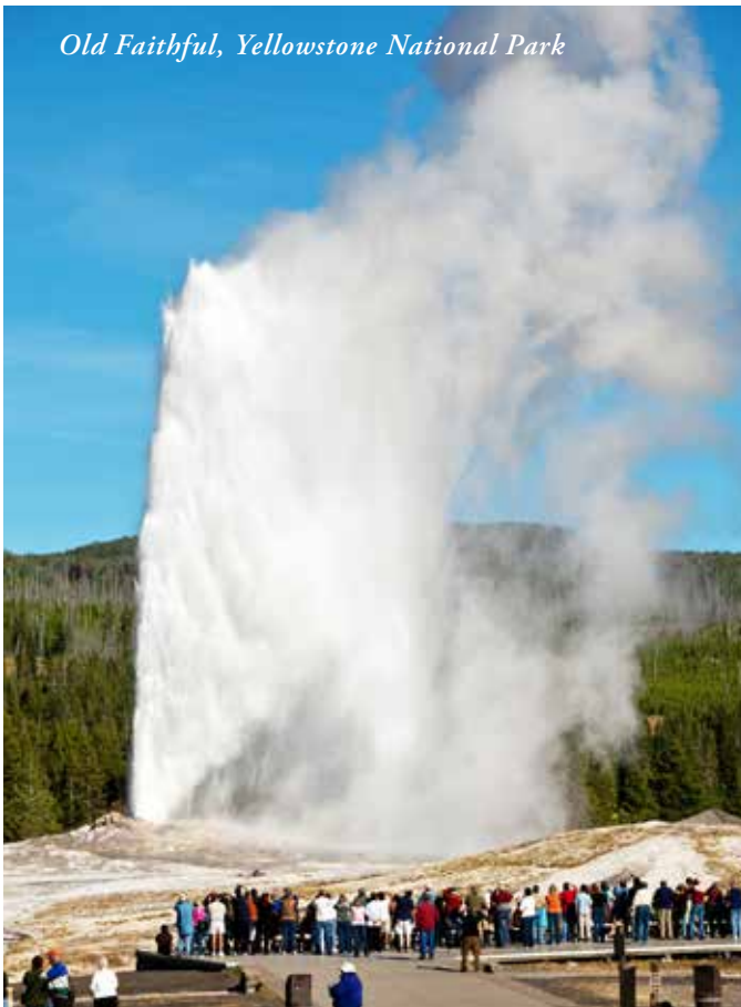
Old Faithful, Yellowstone National Park

Discover the heart of Montana's natural beauty, coined "Gates of the Mountains" by famous explorer Meriwether Lewis. A guide narrates our journey down the scenic Missouri River, sharing historic stories of Lewis and Clark's explorations, the Hauser Dam collapse, and more. As we marvel at the rugged scenery with towering limestone cliffs to both sides of the boat, we may witness intriguing wildlife, such as bighorn sheep, mountain goats, and eagles.