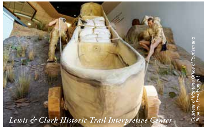
Lewis & Clark Historic Trail Interpretive Center