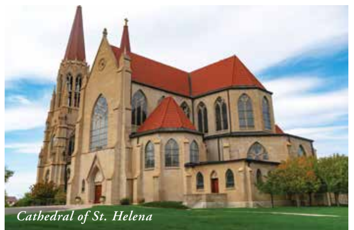
Cathedral of St. Helena