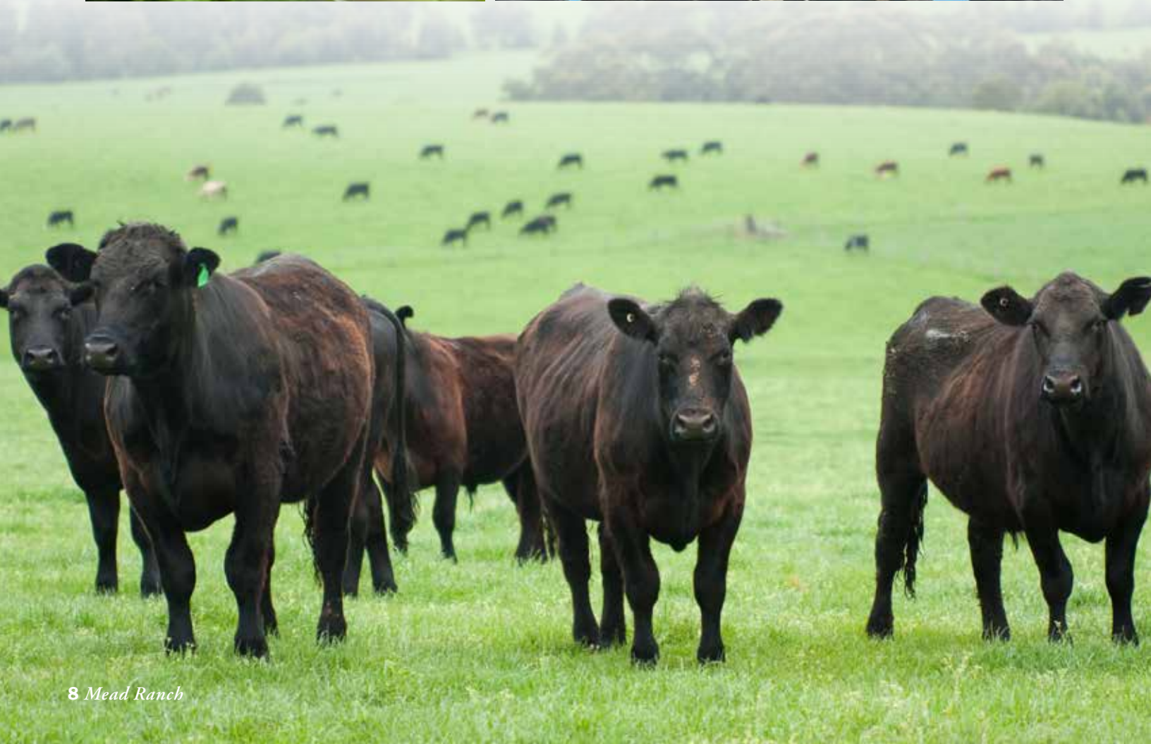
8 Mead Ranch