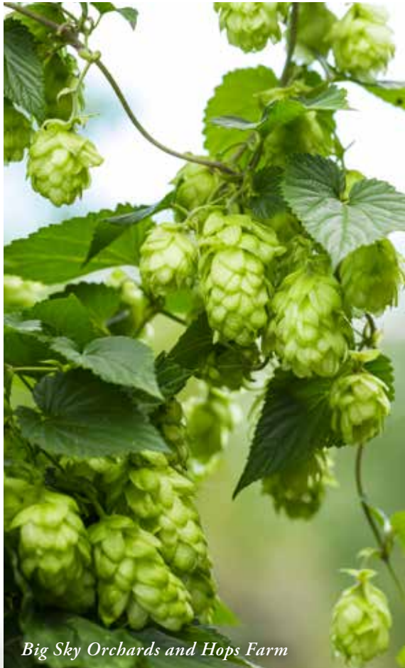
Big Sky Orchards and Hops Farm